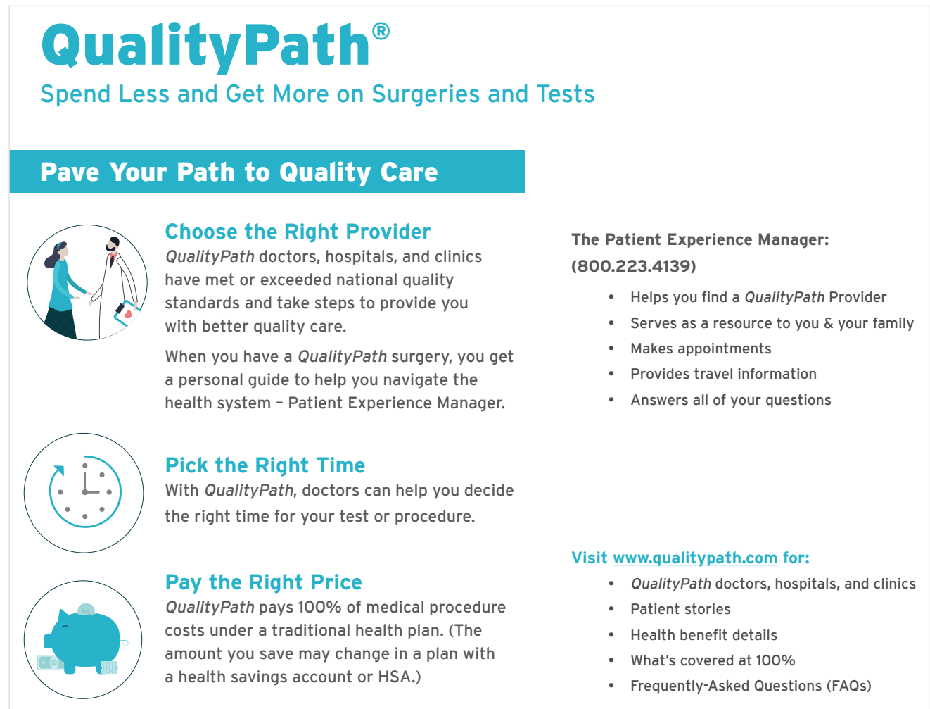
Figure 3. The Alliance - Quality Path Key Concepts & Requirements for Provider Participation